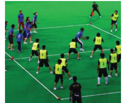
Japanese students playing Dodgebee

For more information on Dodgebee, visit www.dodgebeeusa.com