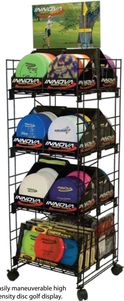
Rolling four shelf display with Ken Climo Topper

Easily maneuverable high density disc golf display. 200 discs in 4 square feet of floor space.