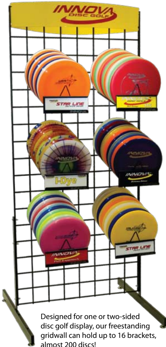
Freestanding gridwall display rack with 6 gridwall brackets

Designed for one or two-sided disc golf display, our freestanding gridwall can hold up to 16 brackets, almost 200 discs!